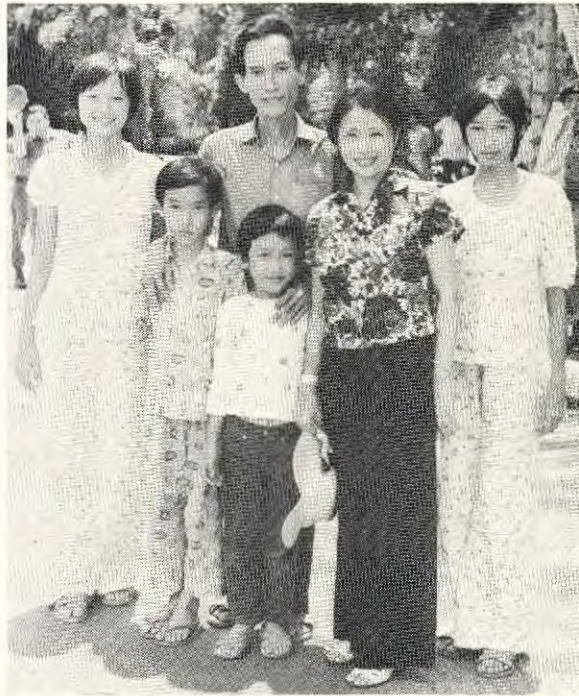
Fig. 1. Taken at Dodswell Ridge—one family that had made it to the end of the line complete as far as was known: but the memories of their journey will always be with them, as the father's still gaunt and strained expression reveals.