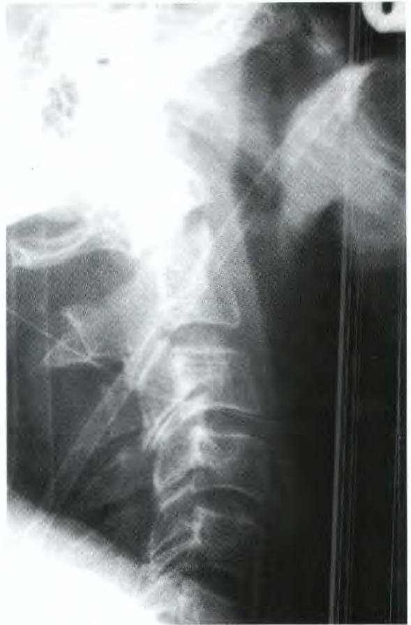
Fig 2. Odontoid Peg Fracture, Patient 4.

He had seatbelt contusions over the right flank. He was suspected of having spinal injuries, without neurological deficit. X-rays confirmed that he had an unstable fracture of the odontoid peg (Fig 2), a crush fracture of the 12th