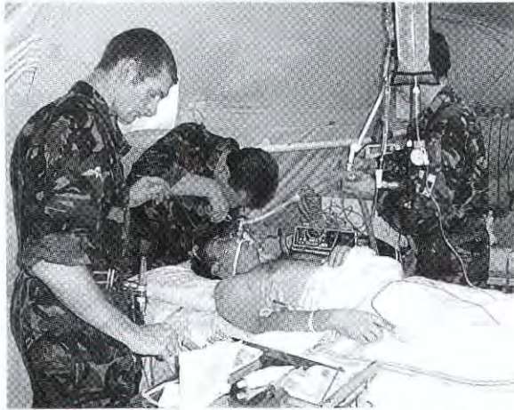
Fig 3. Stabilisation of Polytrauma Patient Prior to Aeromed.