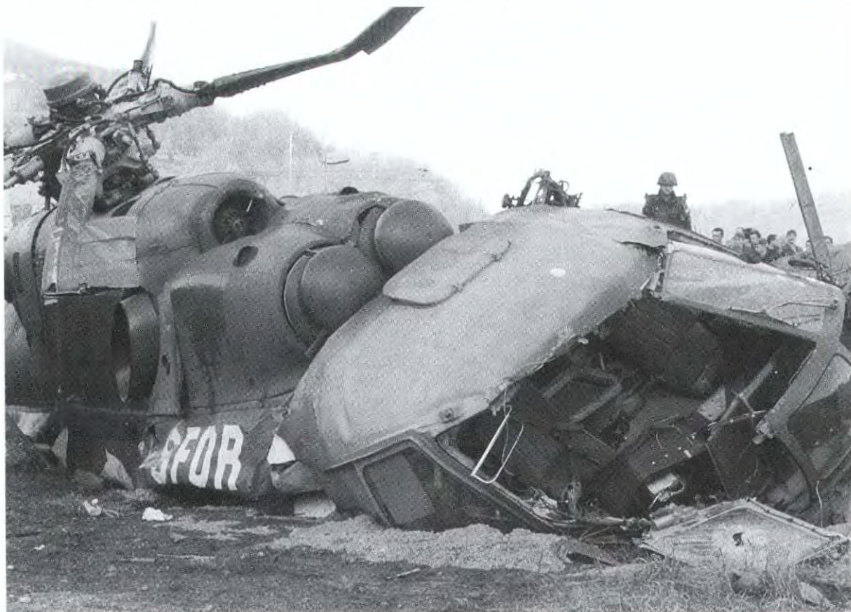
Fig 1. Crashed Hip, 8 Jan 98 (courtesy of RMP, SIB).

in Bosnia in September 1997, fire had engulfed that helicopter and there had been few survivors (Fig 1). Access to the helicopter was hazardous as the engine was still running and the main rotor blades were fragmenting as they hit the ground. The rescuers used metal-cutting equipment and saws to gain access to the cockpit, risking further injury to the occupants. Initial extraction was therefore rapid and emergency first aid was performed as soon as practicable.