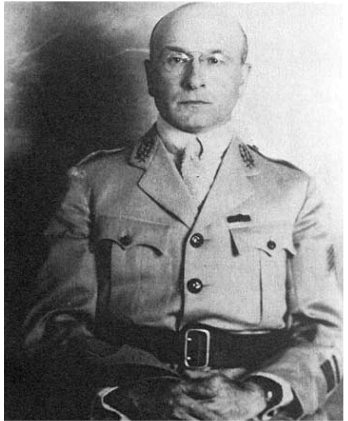
Fig 4. Alexis Carrel in the French Army

Alexis Carrel was to serve in the French military on two occasions, once as a young man in 1895 and again during the First World War. It was between these times however that he was to make the groundbreaking contributions that were to win him the Nobel Prize for Medicine in 1912 (5). Carrel was inspired to work on the technical aspects of vascular suturing following the death of the French President, Sadi Carnot in 1894. Carnot was stabbed through the abdomen by an Italian anarchist, the blade severing his portal vein. Carnot died despite the attentions of the finest surgeons in France due to