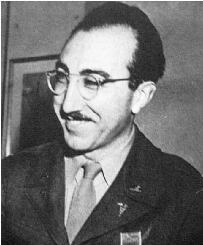
Fig 5. Mike DeBakey

original research provided the foundation stones of the modern cardiac perfusion pumps today. In 1939 Carrel was forced into mandatory retirement at the age of 65 years and became somewhat embittered as a result. He nevertheless embraced a new challenge and poured his energies into setting up his own Institute in France. Carrel kept clear of all political matters and sought instead to promote his foundation. He met with the occupying Germans in order to protect the work of his Institute and as a result, he was accused of Nazi collaboration, the strain from which resulted in his first heart attack in 1943. Although he recovered and returned to his work, he had a further relapse a year later that left him severely restricted. Following the liberation of France the accusations of collaboration with the Nazis intensified although no proof was ever produced. He died on 5 November 1944 in the early hours of the morning. The final tragedy was that French Radio reported nine hours after his death that he had fled his home to avoid trial for collaboration. This unjust end to a life of devoted discovery does not nevertheless detract from his formidable achievements.