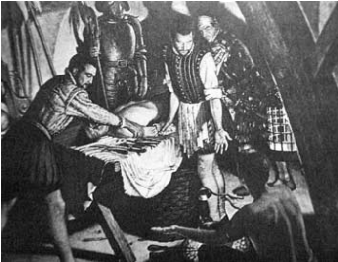
Fig 1. Paré's oil is exhausted.