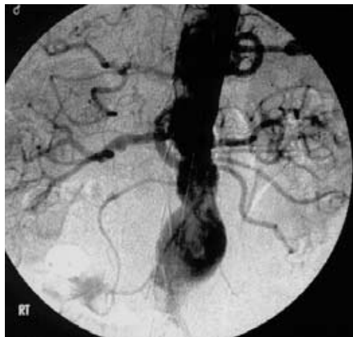
Fig. 2 An arteriogram showing an aneurysm in the region of the anastomosis of the graft that can just be seen as a faint outline inferiorly.

confirmed in the anterior aspect of the infrarenal abdominal aorta. The proximal limb of the graft was well incorporated by the surrounding tissues and after clamping the fibrin plug was entered. The native aorta was found to have undergone some true aneurysmal change confirming the CT scan and arteriogram findings. The graft was