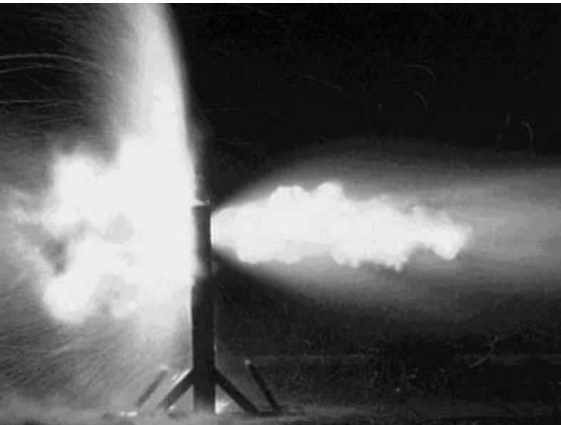
Fig 3. Penetration of armour plate by combined anti-personnel fragmentation/shaped charge warhead.

so close to their targets, the fragments may have a high enough velocity to penetrate body armour. The new 20 mm grenades will be light, so a large number can be carried. Placing such a weapon in the hands of every infantryman (the intention of several nations, including the USA - see Figure 2) would transform the firepower available to unsupported infantry out to 1000 metres.