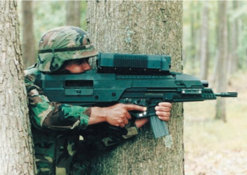
Fig 2. US Objective Infantry Combat Weapon (OICW); note the 20 mm barrel above the 5.56 mm barrel.