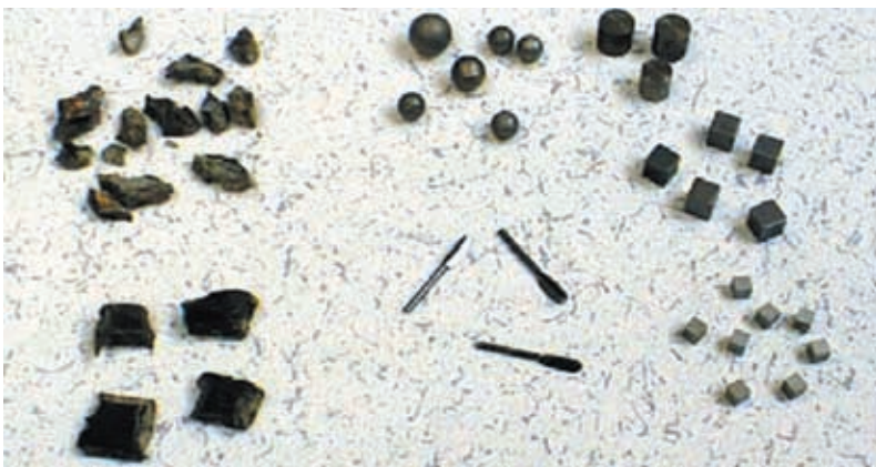
Fig 2. Types of pre-formed fragments for anti-personnel and anti-materiel use. The lower centre "fragments" are flechettes.

Many modern fragment munitions are designed to produce multiple pre-formed (or partially pre-formed) fragments of a