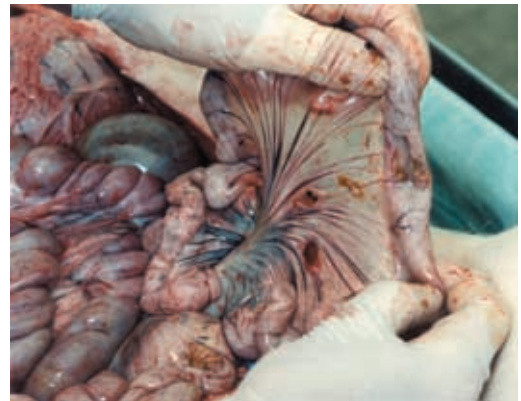
Fig 4. Perforation of mesentery and small bowel by a small anti-personnel fragment simulator. The wounds are small and discrete.

The available energy of these projectiles is low and the wounds in bowel are small and discrete with little surrounding visceral injury (Figure 4). In an experimental study using 200mg steel fragments fired at 200m/s into porcine colon, the mean diameter of wounds produced was 6.1mm (Edwards 1998). There was almost no surrounding contusion, no mesenteric tearing and often little evidence of a colonic wound other than