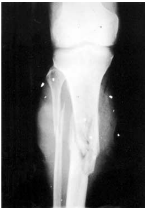
Fig 3. Comminuted bone fracture from multiple anti-personnel fragments.

projectile's passage. Structures close to the projectile pathway may be damaged due to the pressure waves and the stretching and displacement caused by the temporary cavity, leaving zones of contusion and concussion, devitalised tissue and haemorrhage within and between muscle fibres (Wang et al 1990). The temporary cavity leaves behind a smaller permanent cavity containing fragments of necrotic muscle and blood clot. Temporary cavitation does not always cause a large zone of tissue damage and skeletal muscle is relatively tolerant of the insult, especially with low energy transfer wounds.