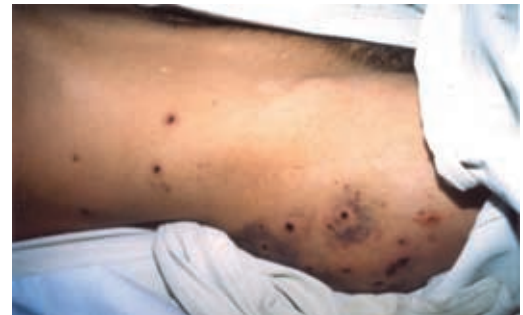
Fig 1. (a) (above) Multiple wounds by small fragments to the buttocks and abdomen of an Afghan fighter. (b) (below) The radiograph shows the size and distribution of the fragments in the pelvic area.

Modern munitions aim to incapacitate soldiers by producing multiple wounds from very small fragments with low available kinetic energy (Figure 1). At the same time, the widespread use of personal body armour has altered the pattern of injury in the wounded and led to a predominance of multiple wounds to the limbs (Ryan et al 1991; Spalding et al 1991; Bowyer 1995) (Table 2).