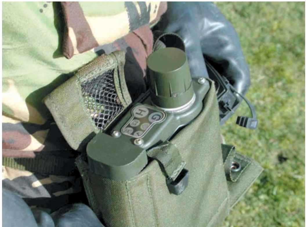
Fig 9. Lightweight Chemical Agent Detector (LCAD) shortly to enter service. It uses ion mobility spectrometry to detect CW agents.

To prevent inhalation of an incapacitating or lethal dose, it is essential that the breath is held and the respirator put on at the first warning of the presence, or suspected