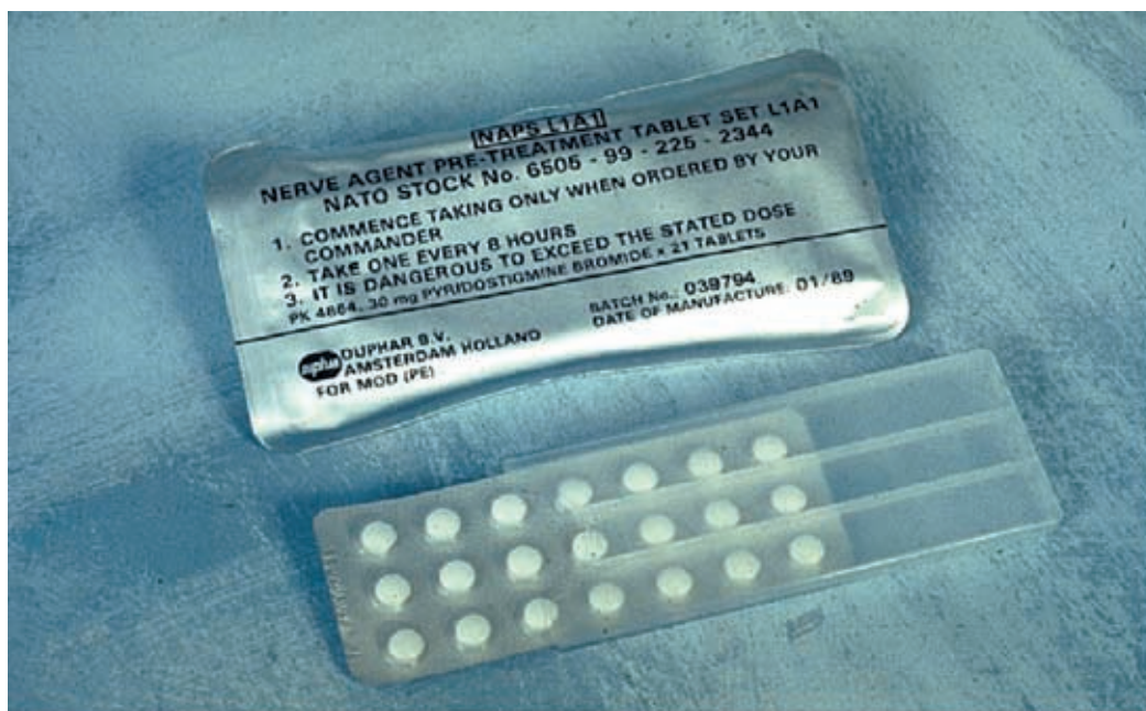
Fig 14. Nerve Agent Pre-treatment Set (NAPS) – Pyridostigmine.

agent. There are no significant signs and symptoms associated with this level of inhibition since: