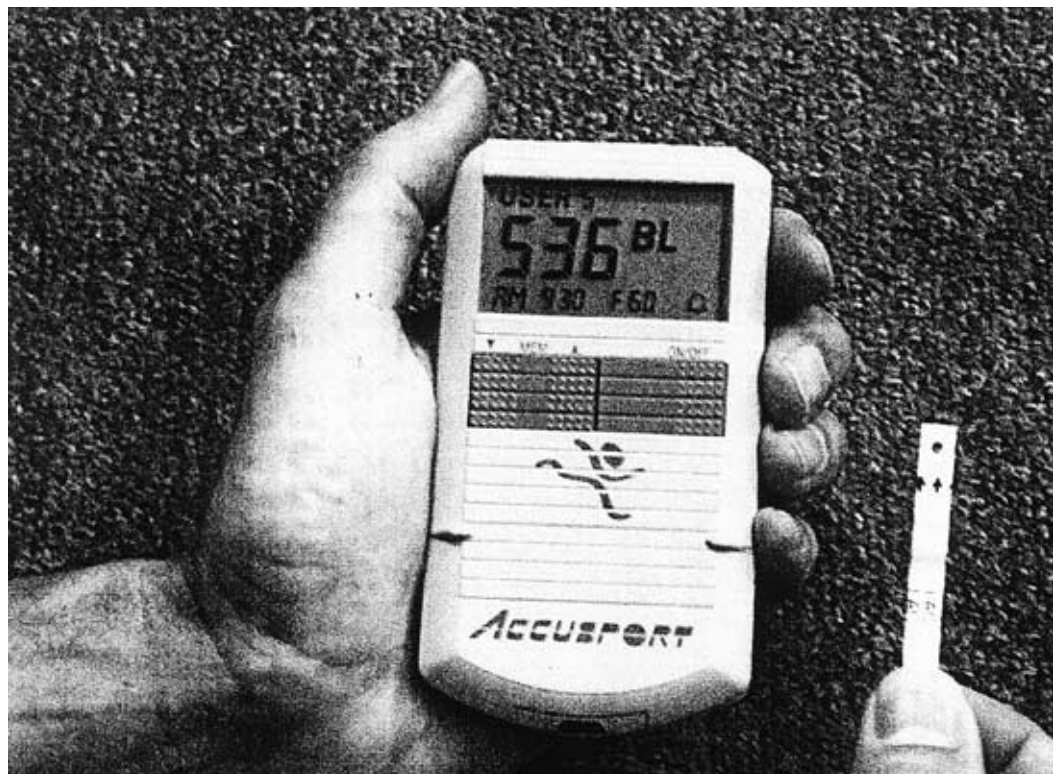
Fig 1. Lactate analyser and test strip.

Medical Officer Defence Medical Services London Helicopter Emergency Medical Service