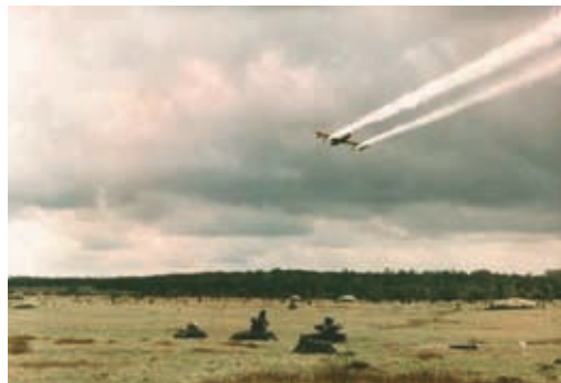
Fig 3. Line source dispersal.

Contamination of Food and Water. Direct contamination of consumables, such as drinking water or foodstuffs, could be used as a means to disseminate infectious agents or toxins. Some foodstuffs, for example chocolate, can allow organisms to survive for long periods, and significantly reduce the number of organisms required to cause