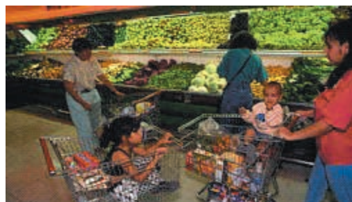
Fig 6. Contamination of food.