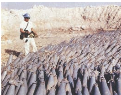
Fig 2. Iraqi Warheads.

A BW attack will take place against a background of continuing natural disease already present in the operational area or amongst the deployed forces. The initial effects of a biological attack on exposed personnel may be difficult to distinguish from a natural outbreak of disease.