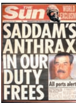
Fig 5. Novel dissemination techniques.

- Primary Aerosol. Large concentrations of aerosolised agent may be generated very quickly by an On-Target-Attack, whether from spraying or bursting munitions, exposing personnel to high levels of inhaled challenge. Protection against such challenge levels may require the combined employment of medical prophylaxis and full respiratory protection (individual or collective) for as long as the primary aerosol persists in location, until dispersed, diluted or possibly decayed, which may