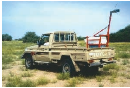
Fig 4. Ground based aerosol generation.

disease. This method of attack would be most suitable for sabotage activities and might be used against limited targets such as water supplies or food supplies of a military unit or base. Water purification systems significantly reduce this hazard, but supplies may be contaminated following treatment.