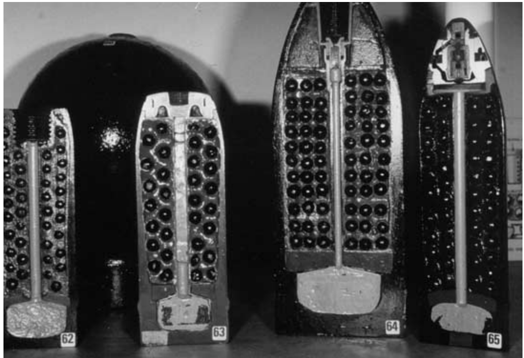
Fig 2. Shrapnel shells from the First World War.

1940s that discourage this. This effort was continued by one of the authors (NMR) in a short historical note and an editorial (3,4) both approximately 35 years ago, making a plea that the term “fragment” would be more appropriate than “Shrapnel” in describing wounds caused by a variety of devices that sent multiple fragments through the air. While definitions were addressed it remains popular, unfortunately, around the world to describe multiple wounds as Shrapnel wounds. Recognising that wars and increasing terrorist acts continue to plague civilian populations, as well as military organisations in many parts of the world, it seems timely to readdress the question and review historical information.