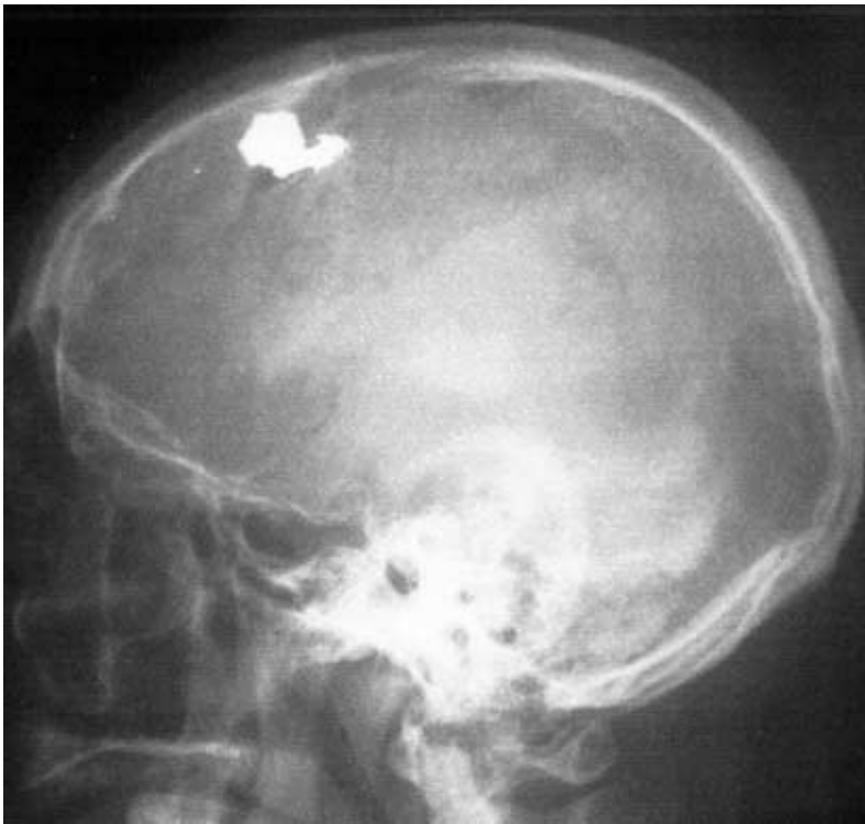
Fig 4. Shrapnel injury to skull.

He had no neurological deficits. The patient was discharged from hospital 2 days postoperatively under police escort.