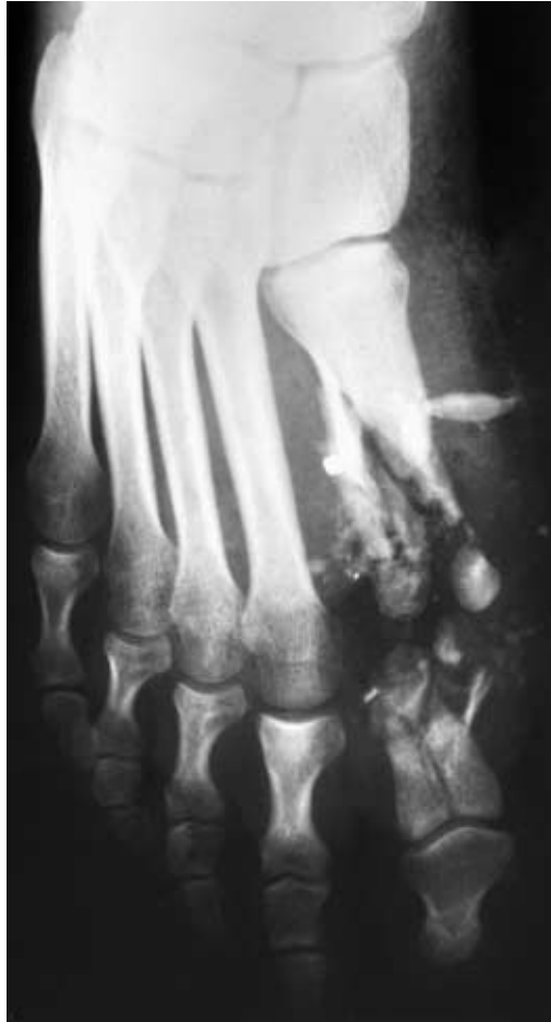
Fig 2. Shattered first metatarsal fragmentation injury.

casualties had been evacuated from the site. Four of these casualties arrived at Groote Schuur Hospital within one hour.