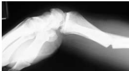
Fig 6. X-ray of angulated forearm fracture.