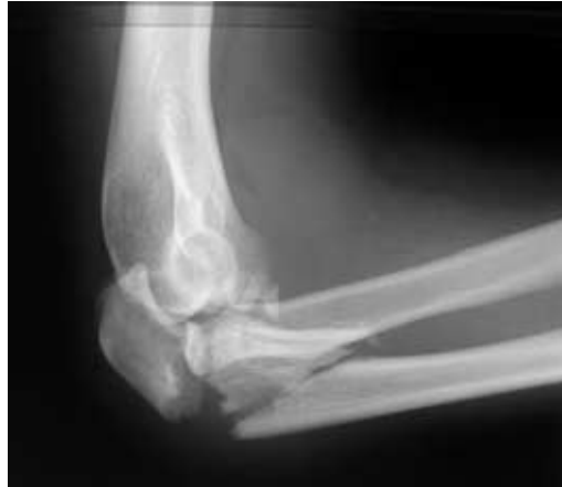
Fig 4. X-ray of ulna fracture.