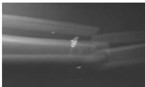
Fig 2. X-ray of tibia and fibula fracture.