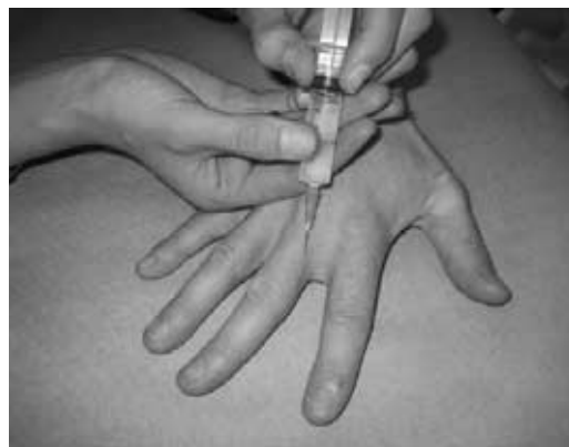
Fig 1. Digital ring block

Before performing a digital ring block, anatomy of the neurovascular bundles should be considered. The common digital nerves are derived from the median and ulnar nerves, and divide in the distal palm into the volar digital nerves, to supply adjacent sides of the fingers, palmar aspect, tip and nail bed area. These main digital nerves are accompanied by digital vessels and run on the ventrolateral aspect of the finger beside the flexor tendon sheath. Small dorsal digital nerves derived from the radial and ulnar nerves supply the back of the fingers as far as the proximal joint, and run on the dorsolateral aspect of the finger. A 25 gauge needle should be inserted at a point on the dorsolateral aspect of the base of the finger and directed anteriorly to slide past the base of the phalanx (Figure 1). The needle is advanced until the resistance of the palmar dermis is felt, then 1ml of solution is injected as the needle is withdrawn 2-3mm to block the volar nerve, and 0.5ml is injected just under the point of entry to block the dorsal nerve. The procedure is repeated on the other side of the finger. This should cause numbness of the whole finger, enabling any necessary procedure to be carried out.