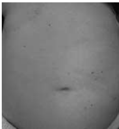
Fig 1. Linear contusion of lower abdomen.

2. You are involved in the resuscitation of a patient with multi-system injuries resulting from a motorbike accident. After the initial phase of resuscitation his core temperature is 35°C. Arterial blood gas analysis shows his pH is 7.22 with a base deficit of 12. By this stage he has had two litres of crystalloid, and is receiving his sixth unit of packed red cells.