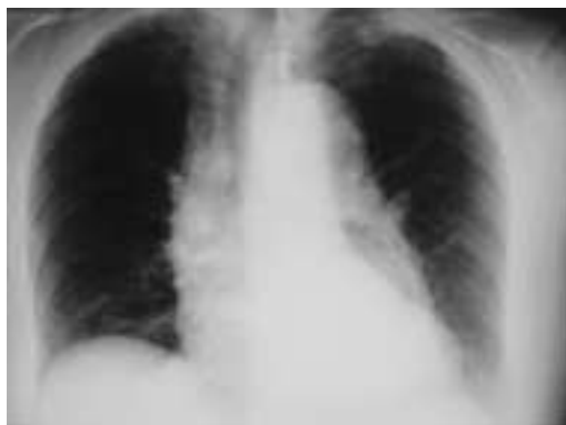
Fig 2. Chest X-ray.