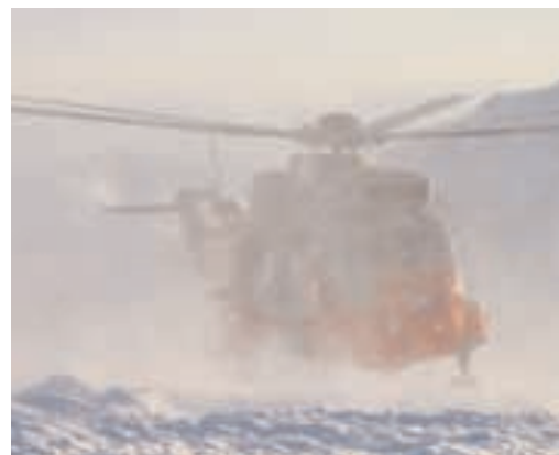
Fig 1. Helicopter winching in action.

saemia have been reported following submersion in the Dead Sea. Rhabdomyolysis (11) may occur if the hypoxic insult to the muscles is extensive and the subsequent myoglobinaemia may precipitate acute tubular necrosis and consequent renal failure. Rhabdomyolysis (11) may occur if the hypoxic insult to the muscles is extensive and the subsequent myoglobinaemia may precipitate acute tubular necrosis and consequent renal failure.