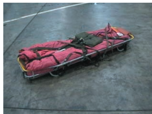
Fig 2. Helicopter stretcher.

Circum-rescue circulatory collapse may also occur following rescue from immersion in water (7,9,12, 13). In the water, there is an increased hydrostatic pressure around the victims legs and trunk which results in an increase in venous return and hence an increase in cardiac output. This increase in central volume is sensed as hypervolaemia by the body and thus a diuresis and salt loss (natriuresis) will occur. Peripheral vasoconstriction will occur due to the relative cold temperate of the water, even in temperate climates, resulting in a further increase in venous return and exacerbating this response. In this way the victim's intravascular volume becomes depleted. One suggested mechanism leading to circulatory collapse is that the myocardium becomes stressed due to increased venous and arterial pressures resulting in increased catecholamine release. Coupled with hypoxia, the increase in circulating catecholamines may provoke cardiac dysrhythmias. A second theory is that removal from the water caus-