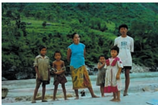
Fig 4. Local Nepalese Children, Sun Khosi River 1998.

Samaritan” cover, even if no payment is given. Any medically qualified person treating any patient has a duty of care and whilst there are no standards of care for expeditions they “need to practice the ordinary skill of an ordinary competent individual exercising that particular act” (10).