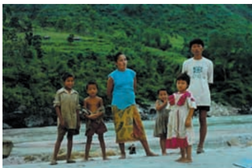
Fig 4. Local Nepalese Children, Sun Khosi River 1998.

Samaritan” cover, even if no payment is given. Any medically qualified person treating any patient has a duty of care and whilst there are no standards of care for expeditions they “need to practice the ordinary skill of an ordinary competent individual exercising that particular act” (10).