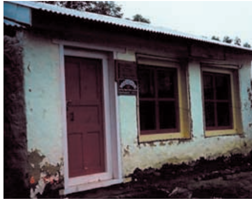
Fig 2. Local Hospital, Phortse, Everest Valley, Nepal.

along the expedition must be thought through carefully. Phone numbers of key facilitators must be readily available, at minimum those of the relevant in-country emergency services, the local British consulate or high commission (with whom early contact should be made if a military expedition) and contacts of senior colleagues or further advice in the UK. The possibility of telemedicine should also be considered and may be of particular use to more junior doctors or allied health professionals. Consideration of tri-band mobile phone technology and/or satellite phone communications should be