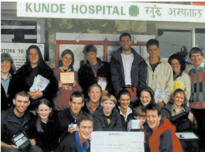
Fig 1. University of Nottingham Medical School Charity Expedition to Kunde Hospital, Khumjung, Nepal 1998.