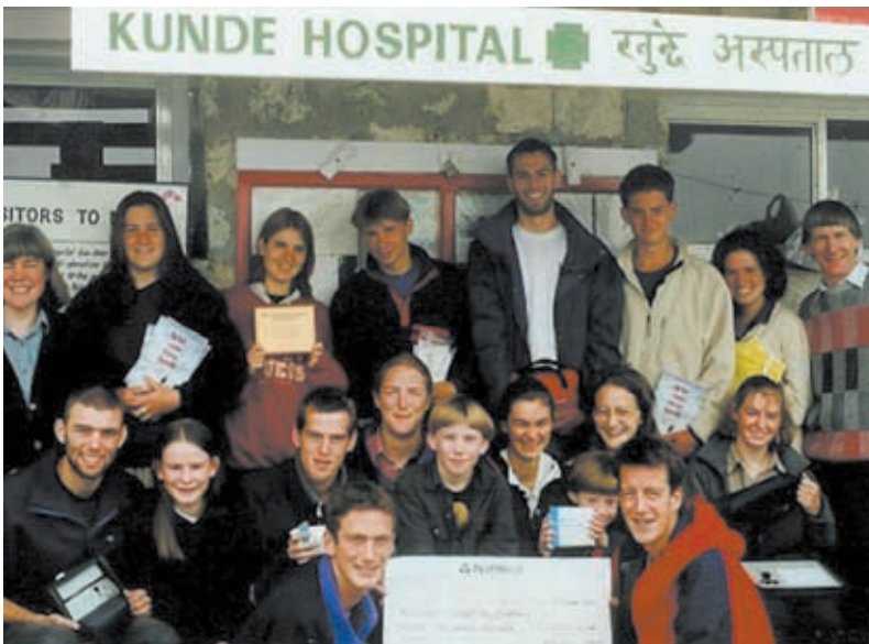
Fig 1. University of Nottingham Medical School Charity Expedition to Kunde Hospital, Khumjung, Nepal 1998.