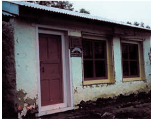
Fig 2. Local Hospital, Phortse, Everest Valley, Nepal.

along the expedition must be thought through carefully. Phone numbers of key facilitators must be readily available, at minimum those of the relevant in-country emergency services, the local British consulate or high commission (with whom early contact should be made if a military expedition) and contacts of senior colleagues or further advice in the UK. The possibility of telemedicine should also be considered and may be of particular use to more junior doctors or allied health professionals. Consideration of tri-band mobile phone technology and/or satellite phone communications should be