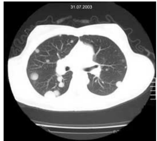
Fig 1. Patients' chest CT Scan showing multiple 'cannon ball' metastases.

Thoracoabdominal CT scanning confirmed lung metastases (Figure 1) and revealed a suspicious liver lesion, abdominal and pelvic lymphadenopathy and bilateral intra-abdominal testes. Initial tumour marker concentrations were grossly elevated: \beta -human chorionic gonadotrophin ( \beta -HCG) 19,079 mIU/ml ( <5 mIU/ml), \alpha -fetoprotein ( \alpha -FP) 6,250 ng/ml ( <5 ng/ml) and lactate dehydrogenase (LDH) 2,000 IU/L (60-225 IU/L). Although there was no formal histological confirmation, the tumour markers, clinical findings and abdominal CT strongly suggested a diagnosis of metastatic non-seminomatous germ cell tumour (NSGCT).