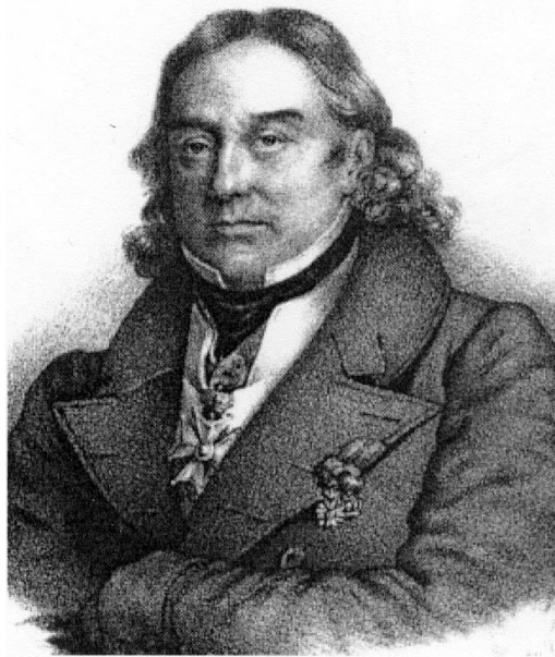
Fig 1. Jean Dominique, First Baron Larrey.