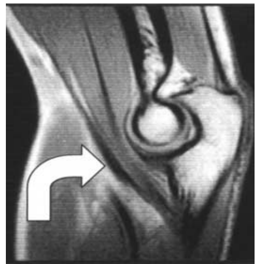
Fig 1. Normal Biceps MRI: Tendon indicated as it passes anterior to elbow joint.

muscle belly and the distal tendon rotates 90° to insert into the radial tuberosity. It is innervated by the musculocutaneous nerve (C5,6,7) which continues to form the lateral cutaneous nerve of the forearm. A broad aponeurosis known as the lacertus fibrosus (or bicipital fascia) arises from the medial side of the distal tendon. This aponeurotic band of fibres radiates from the biceps tendon to form a triangular band passing to the ulna and merges into the deep fascia aiding in the supination of the forearm. Currently there is no effective way to image the lacertus fibrosus (even with MRI), but whether this is disrupted may have a bearing on tendon migration at the time of injury and potential recovery if the rupture is treated non-operatively.