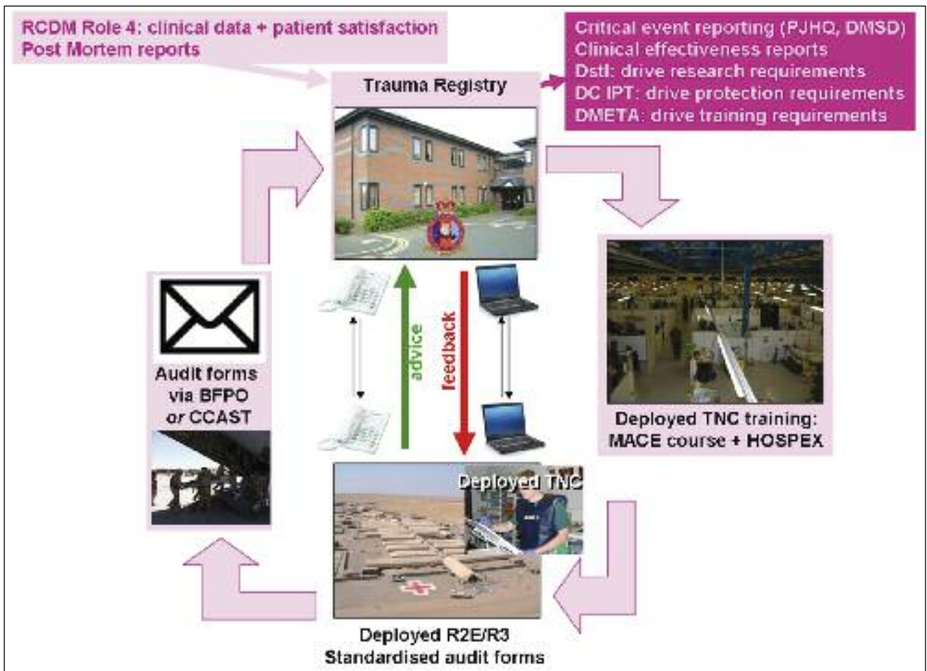
Figure 3: The MACE process